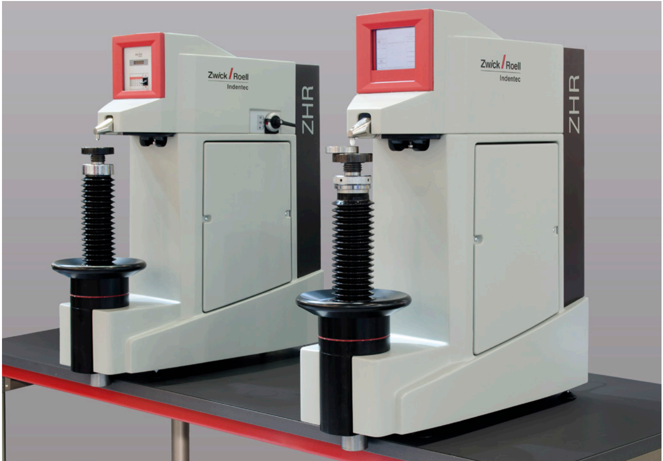
Hardness tester ZHR4150AK