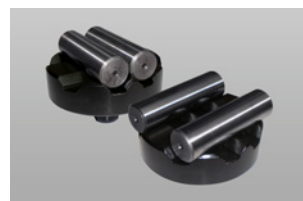
Support tables for round specimens