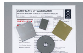
Hardness comparison plate with certificate