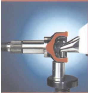
Measuring of the inner contact surface of a cardan shaft driver

Indenter fixturing enables hardness tests on measuring locations that are difficult to access to: