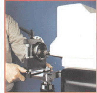
Preparation to measure inside of a gear box part