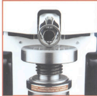
Measuring of the inner contact surface of a bearing's outer ring with 23 mm diameter