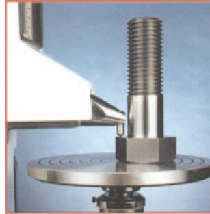
Measuring of the contact surface of a high-strength screw